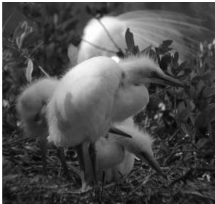
Great Egret chicks.

Menunkatuck Audubon asks its members to help spread the word this spring and summer while out on the waters of Long Island Sound. Happy (responsible) birding!