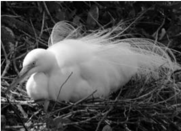
Great Egret.

a special place during summer. It is special not simply because it is a quaint little island in Long Island Sound, but because it serves as a summer home to several members of the heron family, such as great and snowy egrets. It is here that these birds build nests and raise their young. Duck Island is so important to these long-legged wading birds that it was recently designated a Connecticut Natural Area Preserve. For several years, the DEP Wildlife Division has worked with the U.S. Fish and Wildlife Service to cooperatively protect the nesting colony. The interior portion of the island is closed for the season and fenced off from the beach. Nesting area closure (Continued on page 4.)