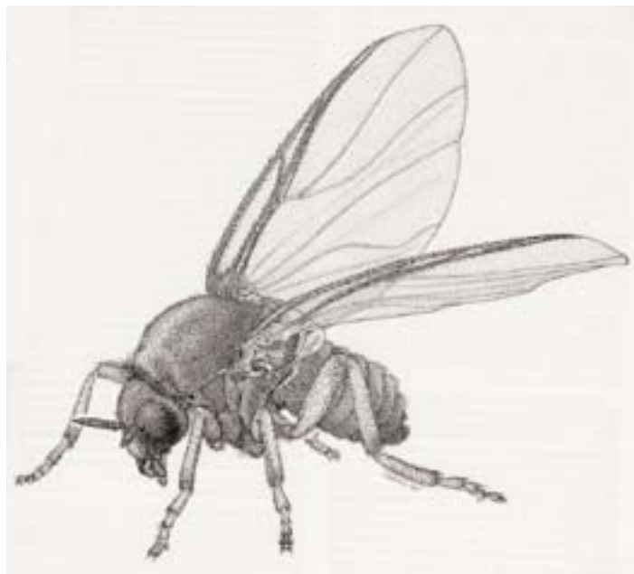
Texas A&M University Research & Extension Service WWW Server

Thankfully, our local black fly population is fairly small and the season is short, so we should consider ourselves lucky. Regions to the north of us where mountain streams produce prodigious numbers of these flies have an unofficial "black fly season," a time best spent indoors. And many a New Hampshire car carries a bumper sticker paying tribute to this very successful insect – it proclaims the black fly New Hampshire's state bird.