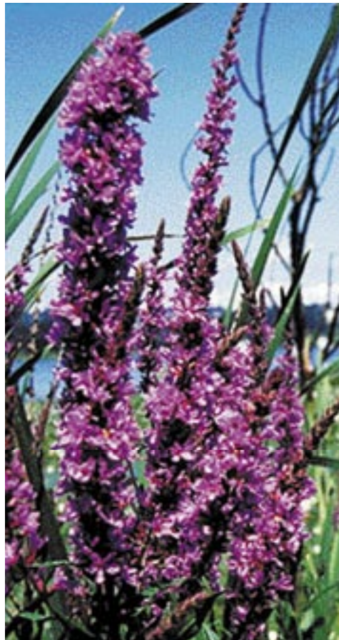
Purple Loosestrife can overrun wetlands thousands of acres in size. Image from King County, WA Noxious Weed List.

pants. A fee of $25.00 will be charged and pre-registration is required. For further information, please contact Cindi Kobak, Education chairperson, at 203-457-1699.