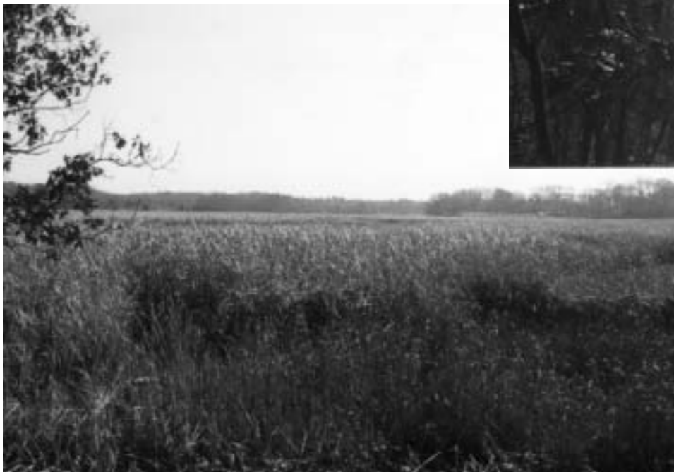
The Spartina grow lush in the Guilford Salt Meadow Sanctuary.