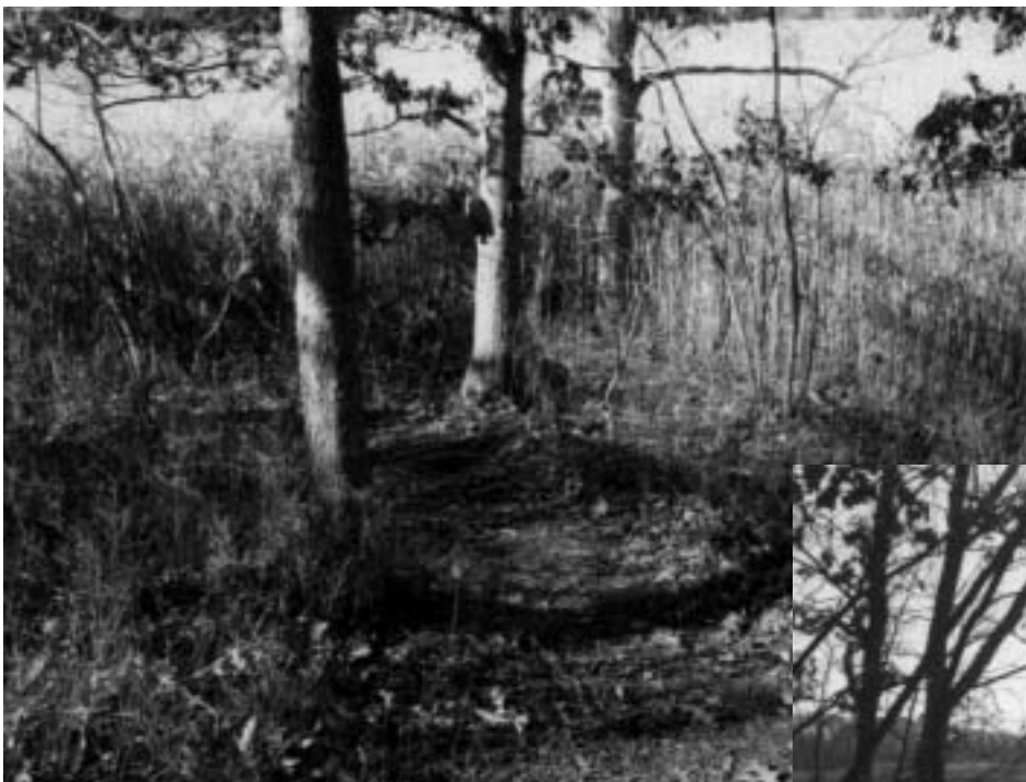
A trail meanders through the woodlands bordering the marsh.