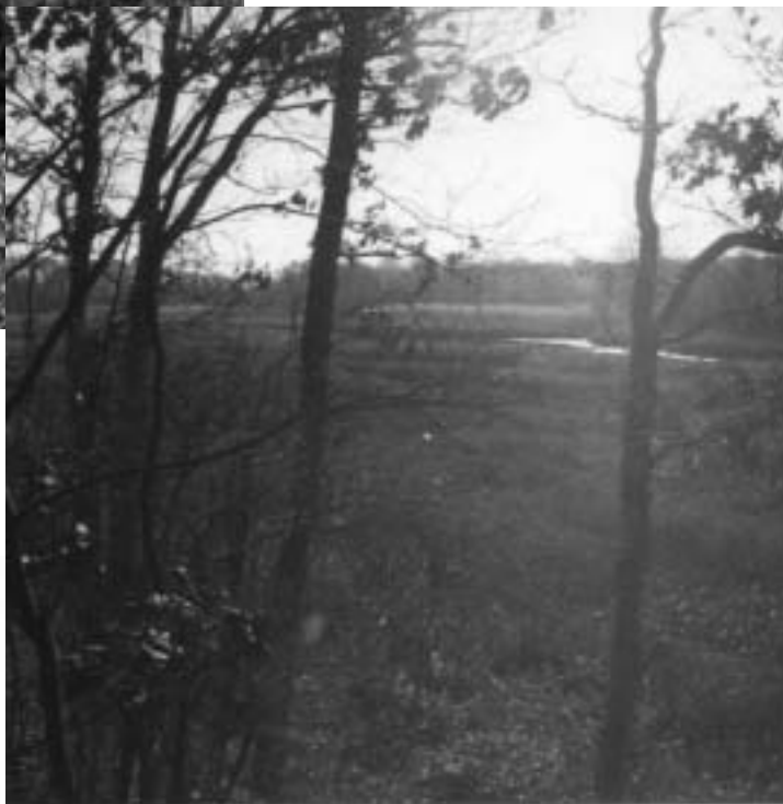
From the trail, there are numerous views of the marsh.