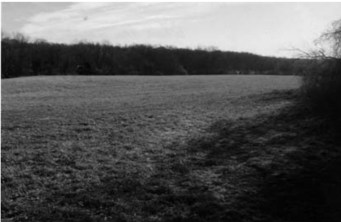
A portion of the 200 acres is upland grasslands.