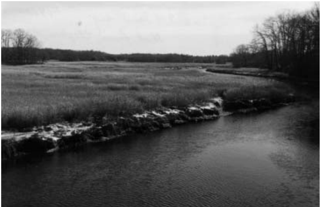
From Clapboard Hill Road, the Guilford Salt Meadow Sanctuary can be seen along the East River